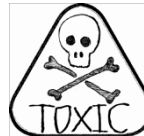
Hazardous to Your Health

Whiners want empathy and connection . They complain by showing disapproval, venting, or withdrawing.